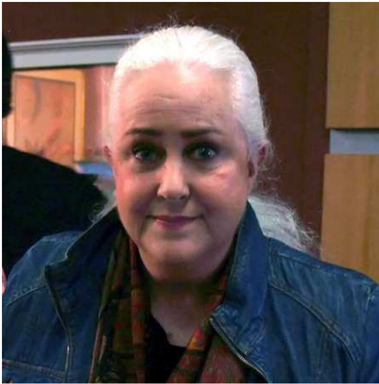
#1. Grace Slick