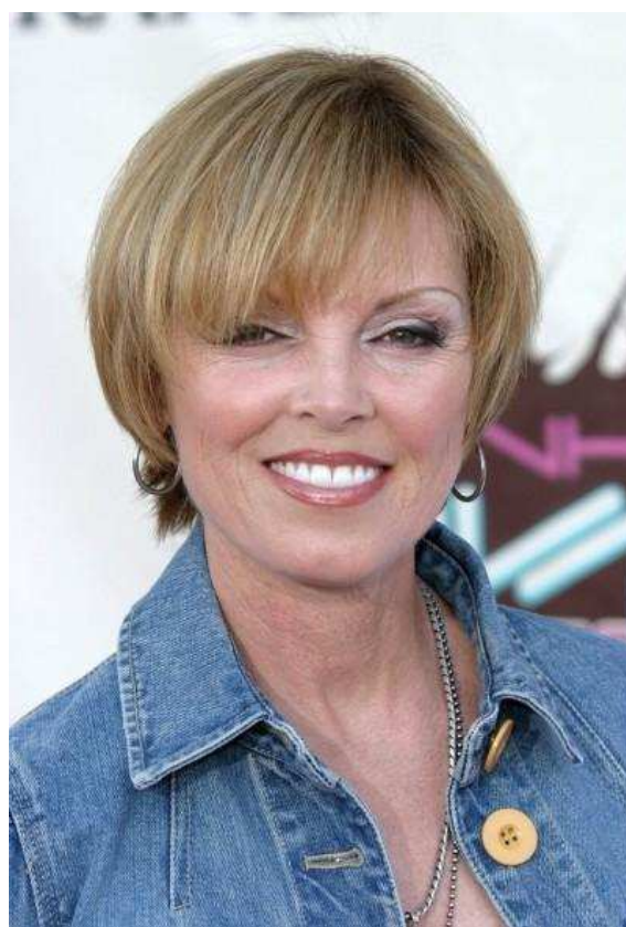
#3. Pat Benatar